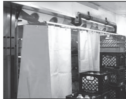
Rear of case with curtains

Note: Please use Hussmann's technical data sheets to get precise dimensions for all store layout purposes.