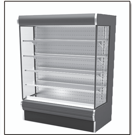
UNIT SHOWN WITH OPTIONAL VIEW ENDS & STAINLESS STEEL INTERIOR

Units are available in Self-Contained or Remote Refrigeration