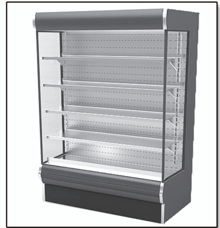
UNIT SHOWN WITH OPTIONAL VIEW ENDS & STAINLESS STEEL INTERIOR

Units are available in Self-Contained or Remote Refrigeration