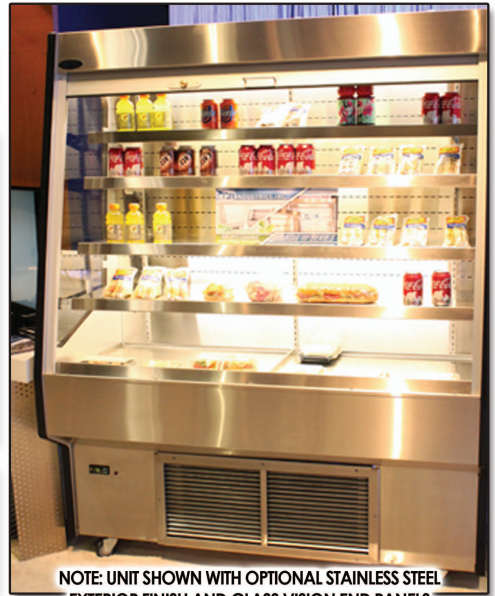
NOTE: UNIT SHOWN WITH OPTIONAL STAINLESS STEEL EXTERIOR FINISH AND GLASS VISION END PANELS

The Bandit III Air Screen SCRFC-III Series is a grab and go style refrigerator. The self-contained refrigeration system includes digital controls allowing the unit to engage in minimal defrost cycles. Front mounted red indicator light alerts the operator if condensing unit requires cleaning. Unique baffled compressor housing for front air intake, top rear air discharge reducing noise levels plus zero clearance from wall installation. Unit also features an optional roll-down locking night cover. Unit comes standard with 4 adjustable extra deep shelves and top canopy light. Optional lights underneath shelving available in energy efficient LED lighting.