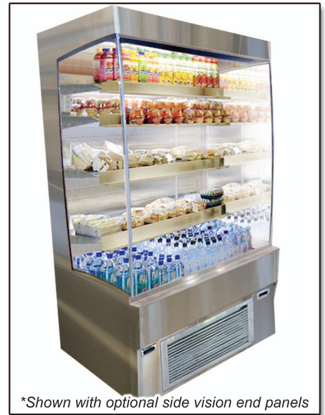
*Shown with optional side vision end panels