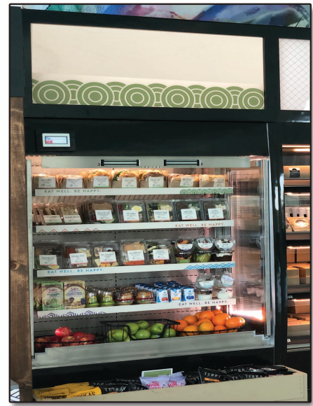
*Shown with optional header & chip rack