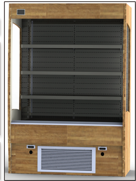
*Shown with optional side vision end panels

Available lengths: 60" Available depths: 33 5/16" Available heights: 78 1/2"