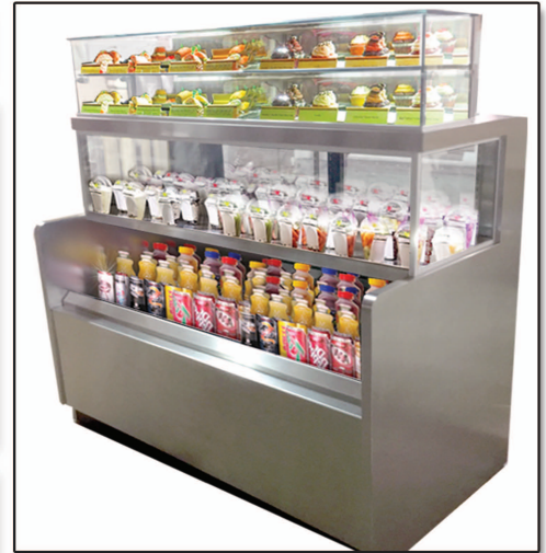
UNIT SHOWN WITH OPTIONAL STAINLESS STEEL EXTERIOR FINISH

The Tribeca SCRFCTT Series is a three section display case consisting of a refrigerated self-service lower section, a refrigerated operator serve mid section and an operator serve split frosted deck and ambient display shelf in a UV bonded glass enclosure. The lower section has a hemmed edge removable deck pan to contain spills.