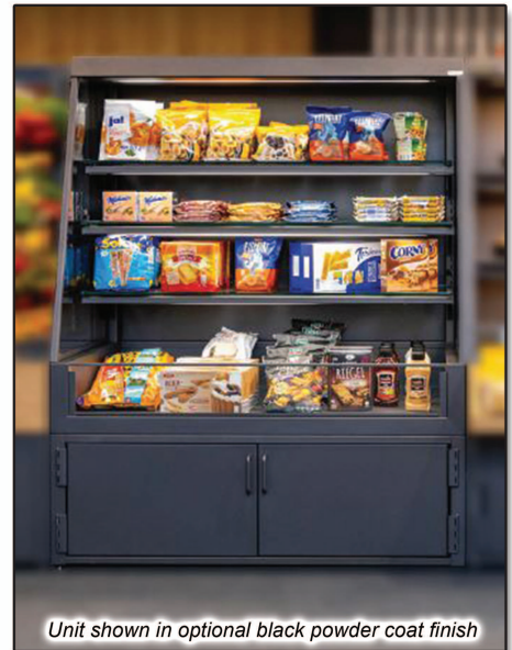
Unit shown in optional black powder coat finish