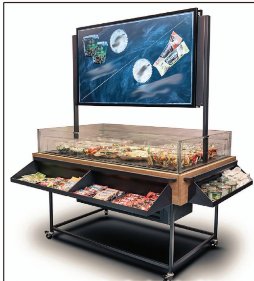
Image is shown with optional merchandising racks, signage, wooden panels and black powder coat.