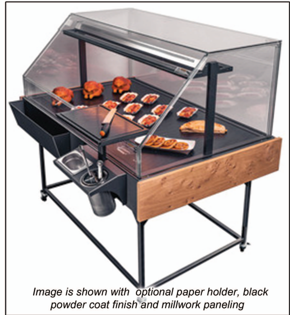
Image is shown with optional paper holder, black powder coat finish and millwork paneling