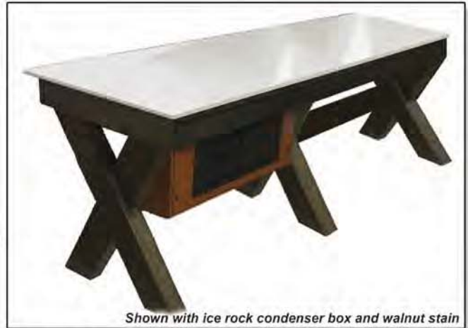
Shown with ice rock condenser box and walnut stain