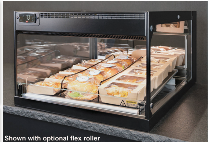
Shown with optional flex roller

Available heights: 15 3/8" 30 3/8" 66" 81"