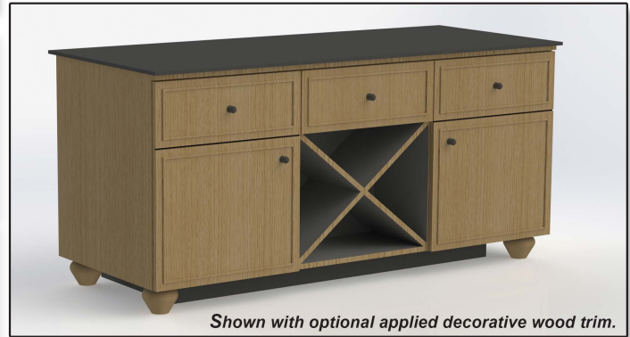
Shown with optional applied decorative wood trim.