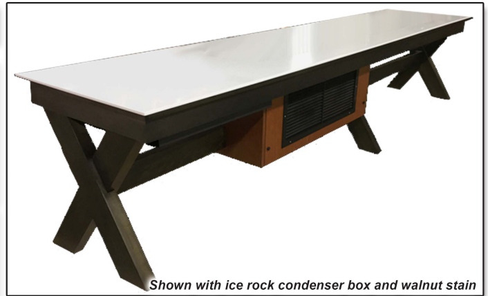
Shown with ice rock condenser box and walnut stain