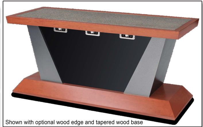
Shown with optional wood edge and tapered wood base