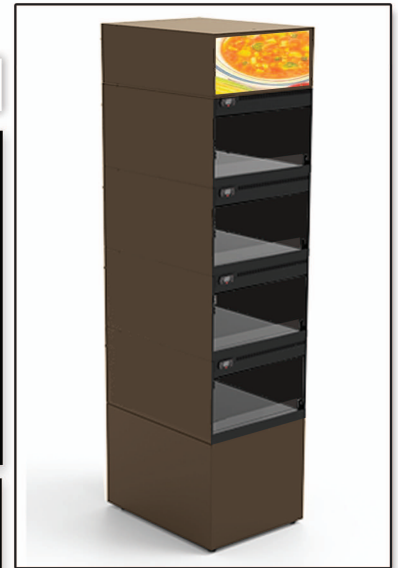
Shown with optional lighted header

Available lengths: " Available depths: 33" Available heights: 91"